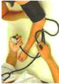
Blood Pressure Screening