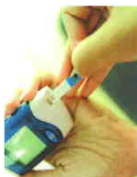
Blood Sugar Screening